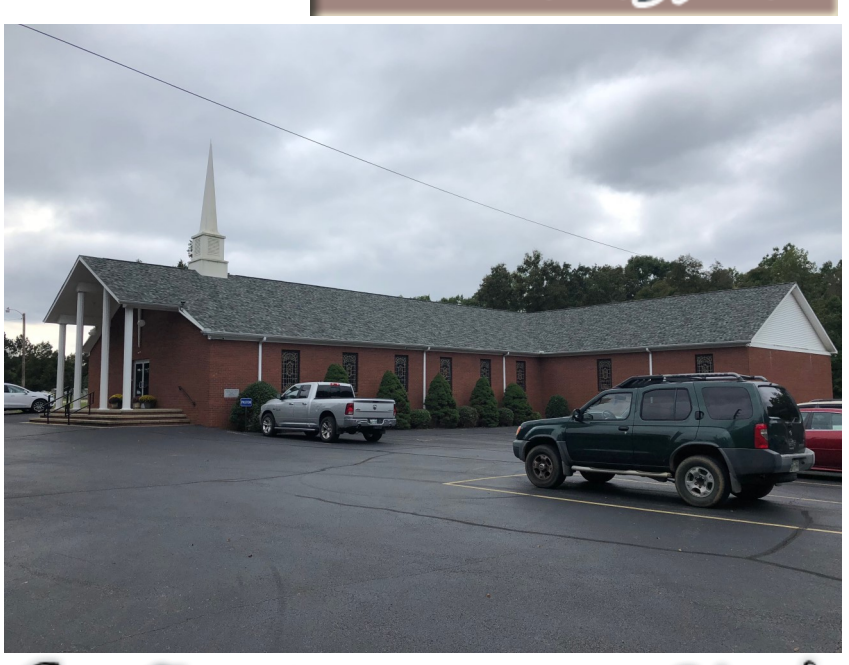
Cross Roads Missionary Baptist Church